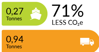
*Shown as tonnes CO 2 emissions, as equivalent to climate impact. The picture shows the difference in transporting 1 container.

ColliCare focuses on green logistics solutions. The transport services of this Norwegian company help to reduce the emission of pollutants into the atmosphere. For example, CO 2 e emissions for the transport of 1 container from Poland to Norway may be reduced by as much as 71% if the transport is made by sea instead of a regular truck.